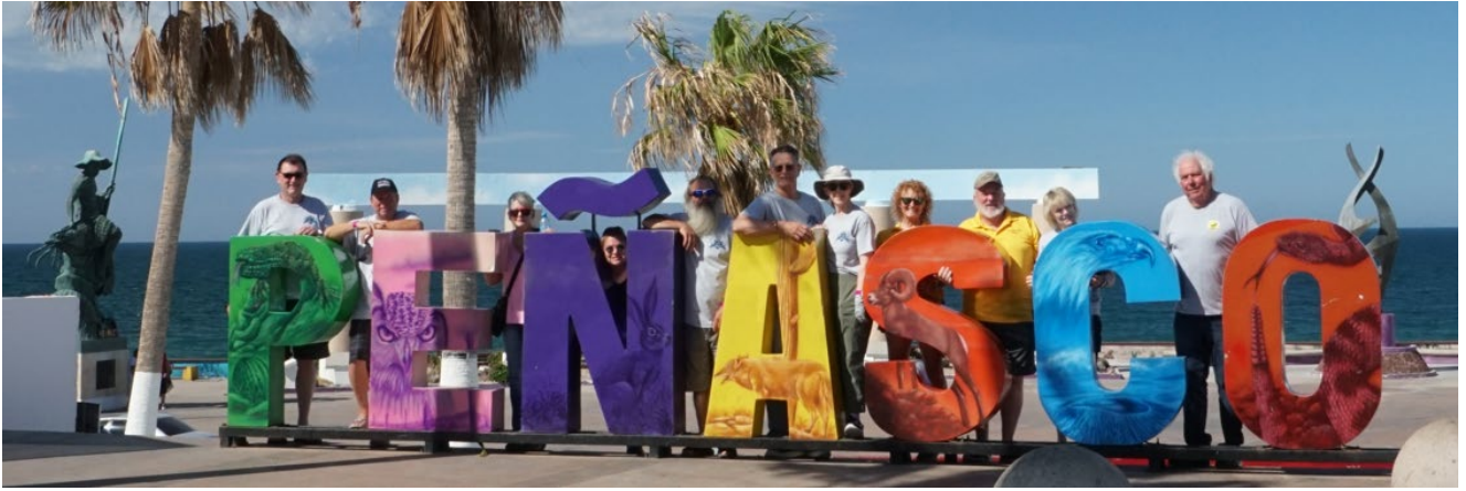
TFC23 Committee Puerto Peñasco