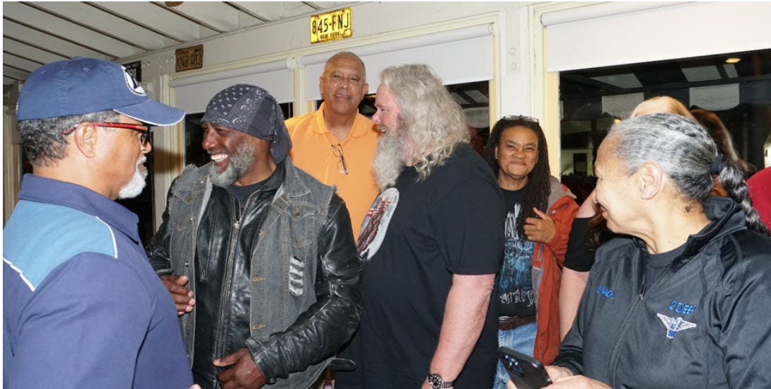
A fun one before a group shot.