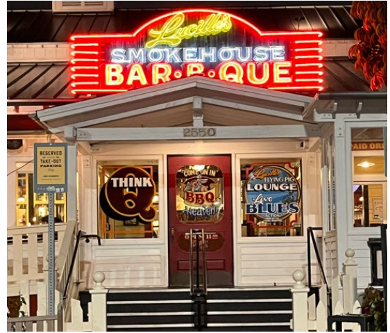
Lucille's Tustin, California