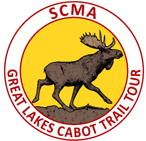
Artwork for the GLCTT Patch