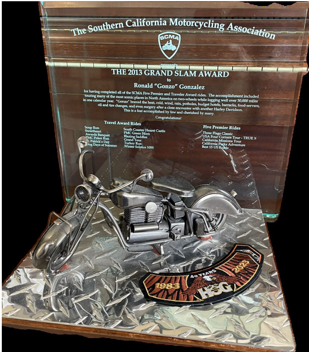
The first ever SCMA Grand Slam Award