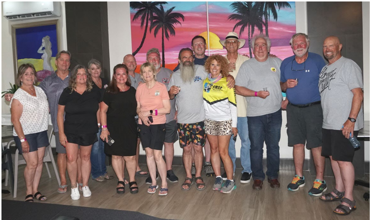
TFC23 Committee and Guests in Playa Bonita Resort - Puerto Peñasco