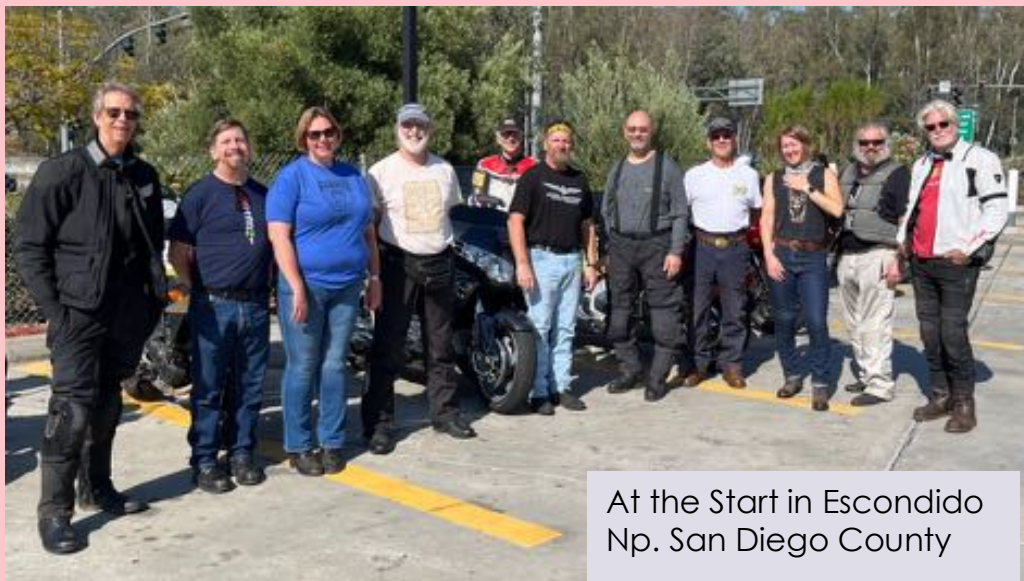
At the Start in Escondido Np. San Diego County

We created a fun route that included the twisty roads of Wilson Valley Road and the scenic sweeping turns that finish with beautifully banked and paved - left to right turns on CA-74 from Hemet to Mountain Center.