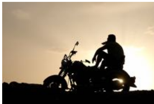
SCMA - More Than Miles

To view a full descriptive list of the roads, please go to the SCMA website at: https://sc-ma.com/rides/best-15-parent/best-15-roads-list/ On the Home page, at the black navigation bar, simply place your cursor on Rides > Best 15 US Roads Challenge > Best 15 US Roads List