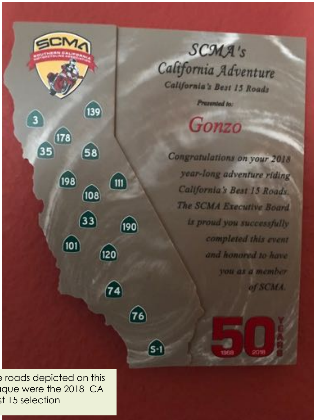
The roads depicted on this plaque were the 2018 CA Best 15 selection