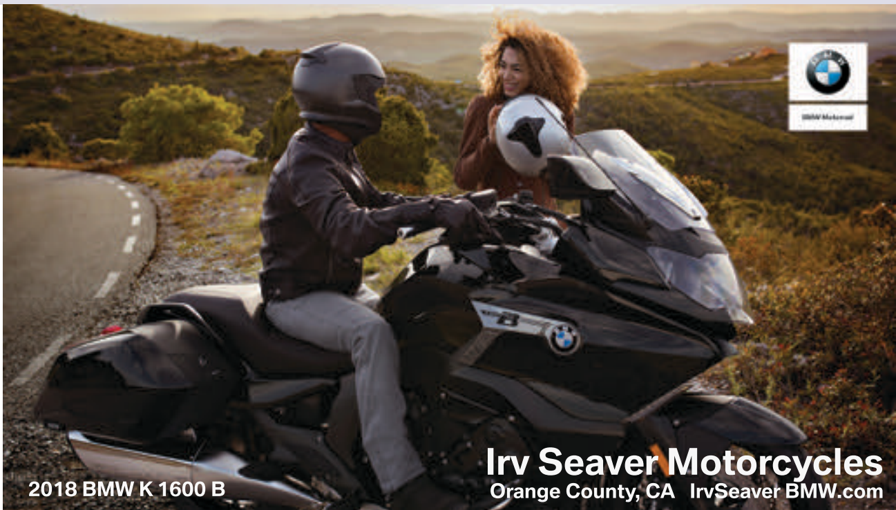
2018 BMW K 1600 B

Irv Seaver Motorcycles Orange County, CA IrvSeaverBMW.com