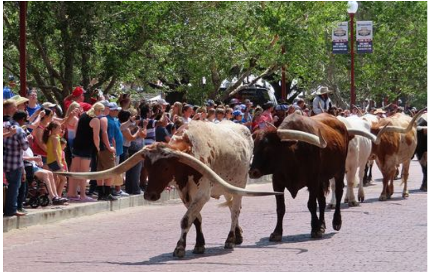
Texas Longhorn Cattle drive in Fort Worth

In El Paso I was back on track hours and miles out of my way. I arrived in Fort Stockton at Midnight PST or 2am CST, and 1,125 miles into my ride. I