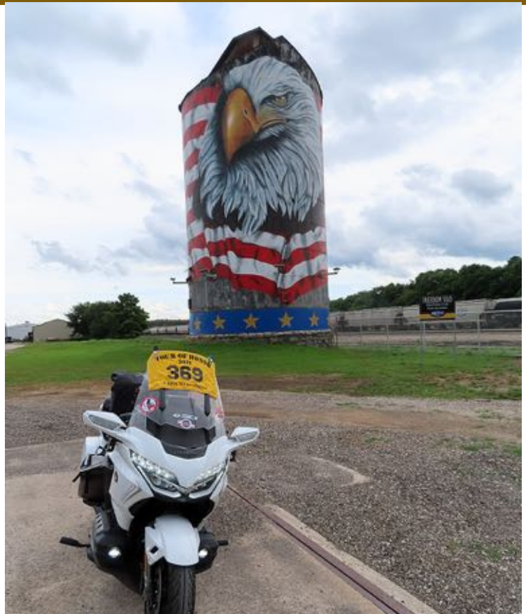
Tour of Honor Freedom Silo 901 Front St. Monett, Missouri GPS: 36.92077, -93.91895 Access: 24/7