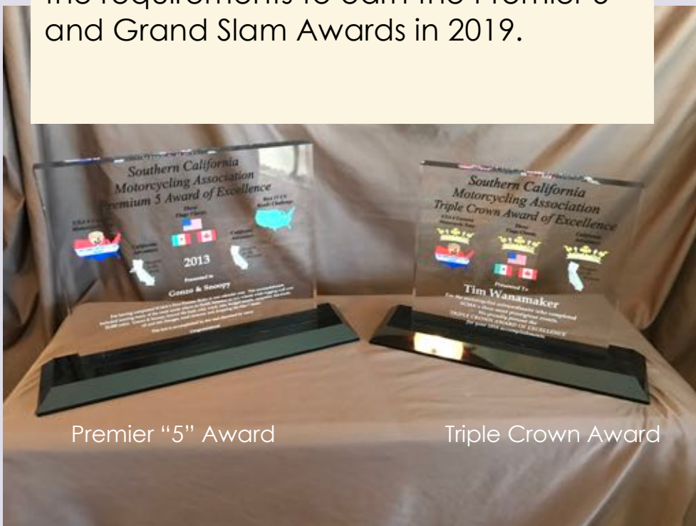
Premier "5" Award

forward to this award to who Premier single year!