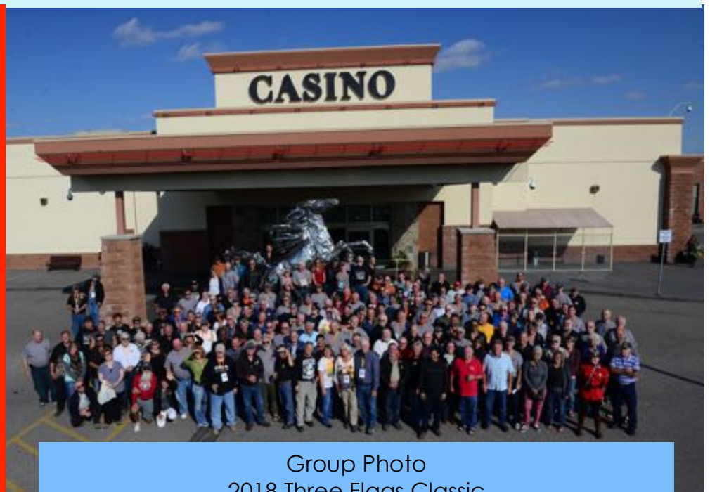
Group Photo 2018 Three Flags Classic Deerfoot Inn and Casino, Calgary, AB, CANADA More Photos at flickr: https://www.flickr.com/photos/135120412@N05/albums/72157697590037172