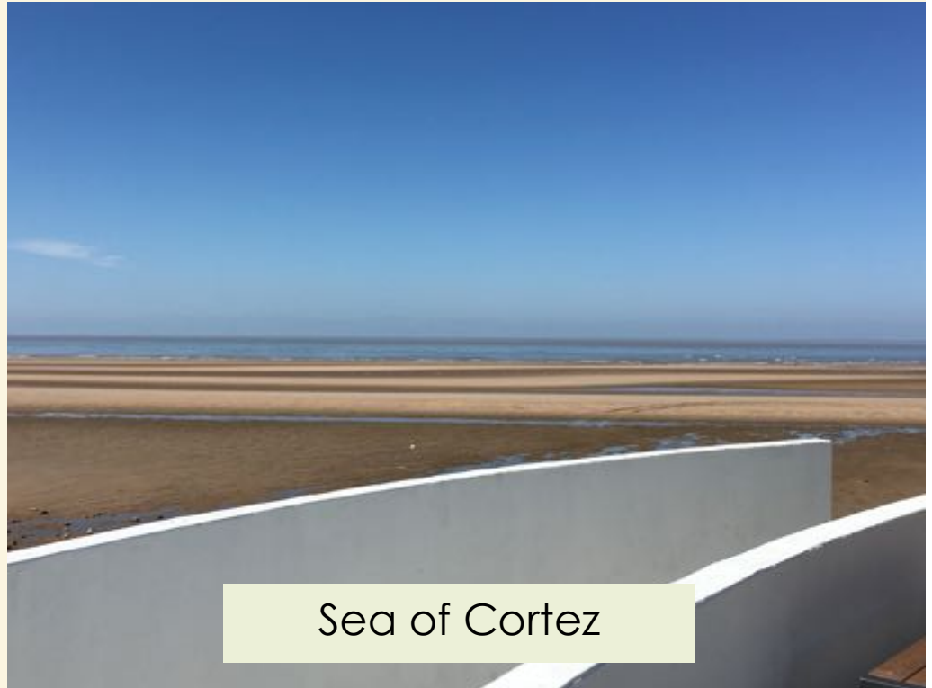
Sea of Cortez

We continued through the desert until we could see the Sea of Cortez. There are intermittent views of the water until we reached El Golfo Santa Clara. We took a short detour and rode through the small town. This is a small beach town where many people come down to camp on the beach and ride their