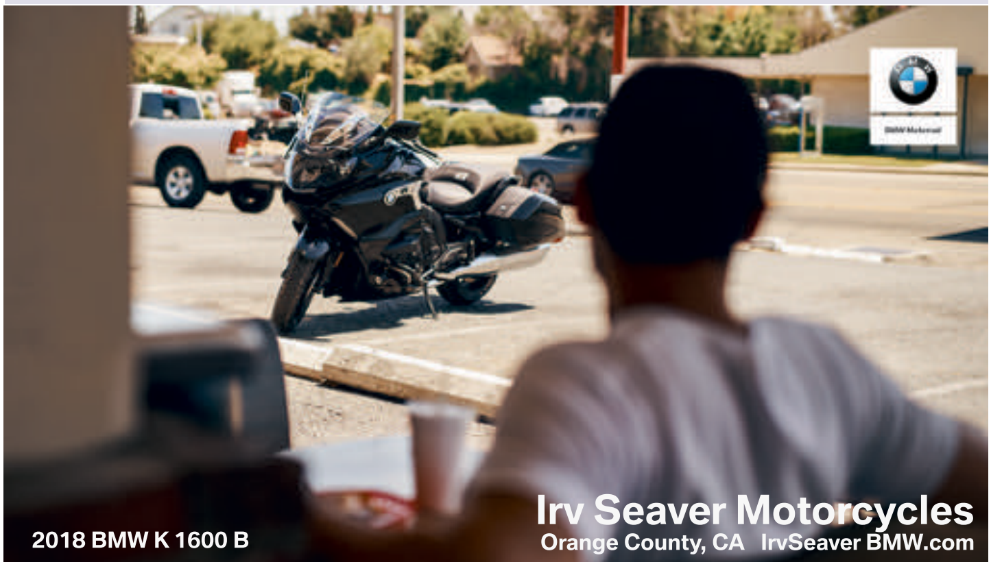
2018 BMW K 1600 B