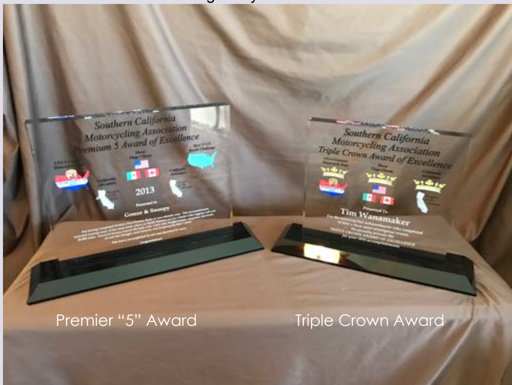
Premier “5” Award

ever*, one of our riders SCMA’s Premier Events in a The asterisk is there