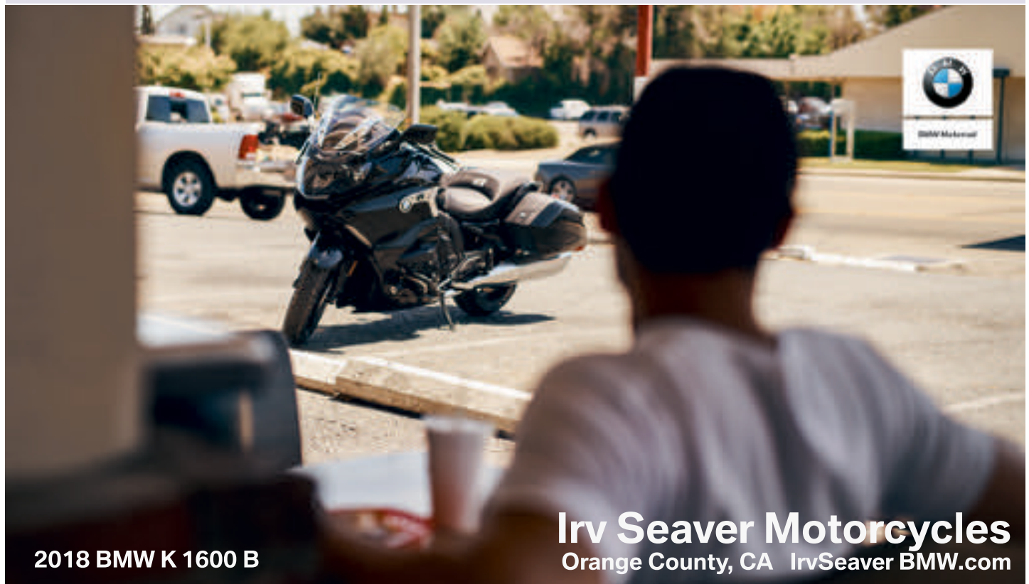
2018 BMW K 1600 B

Irv Seaver Motorcycles Orange County, CA IrvSeaverBMW.com