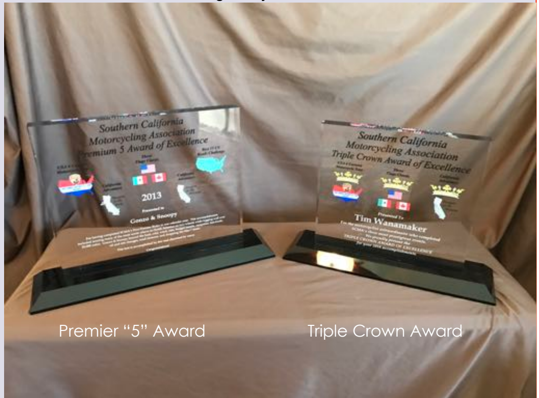
Premier “5” Award

ever*, one of our riders SCMA’s Premier Events in a The asterisk is there