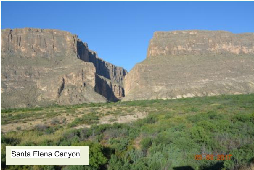
Santa Elena Canyon