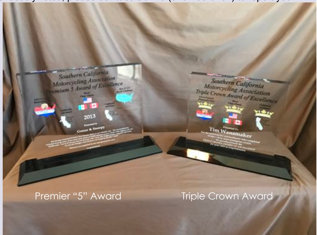
Premier “5” Award

We look forward to presenting this award to past and future finishers who complete all 5 Premier Events in a single calendar year!