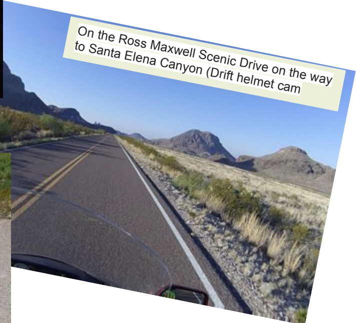
On the Ross Maxwell Scenic Drive on the way to Santa Elena Canyon