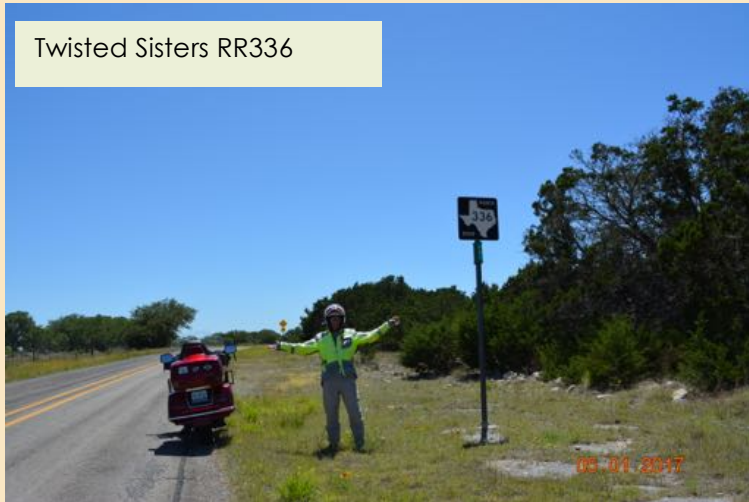
Twisted Sisters RR336