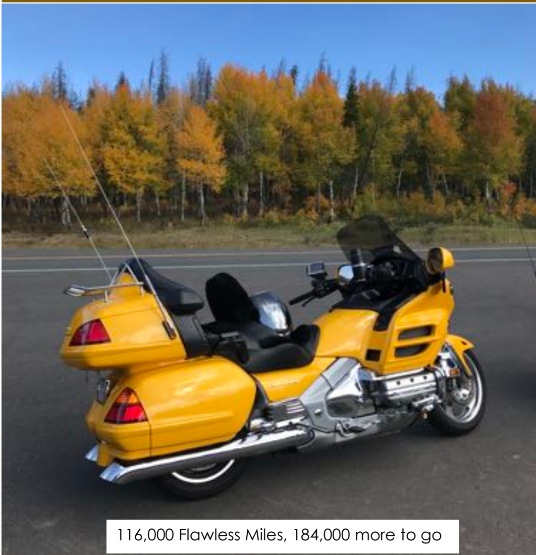
116,000 Flawless Miles, 184,000 more to go