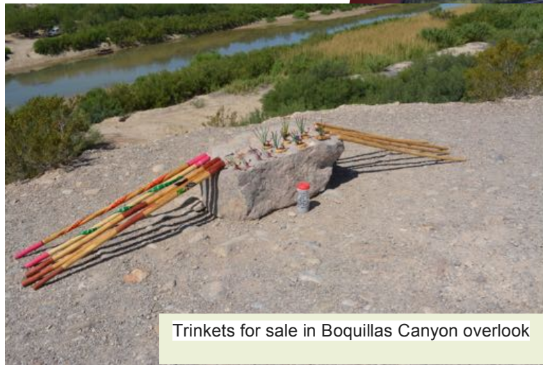
Trinkets for sale in Boquillas Canyon overlook