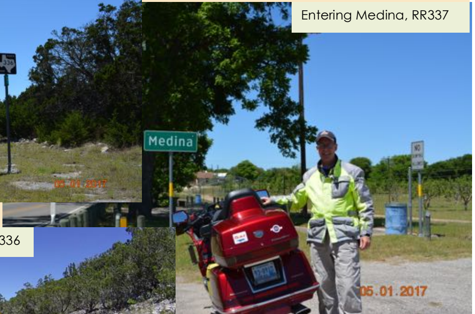
Entering Medina, RR337