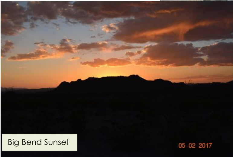
Big Bend Sunset