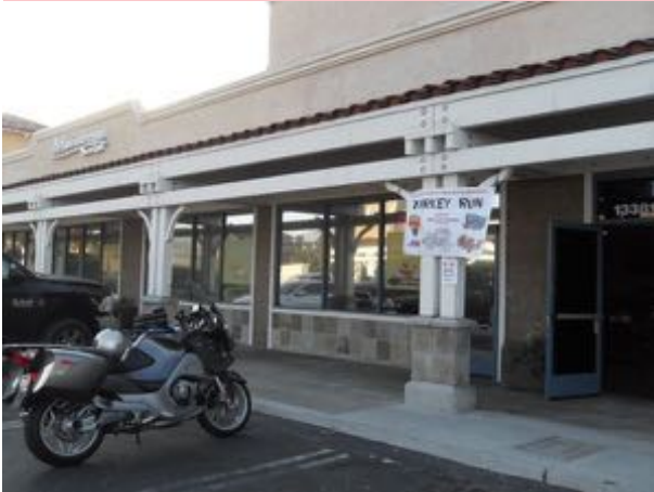
Bakery located on CA-78.

I say Friday night because a few of us, as usual, were at the Poway Best Western, enjoying Chinese take-out by washing it down with Beer 'N Bourbon!