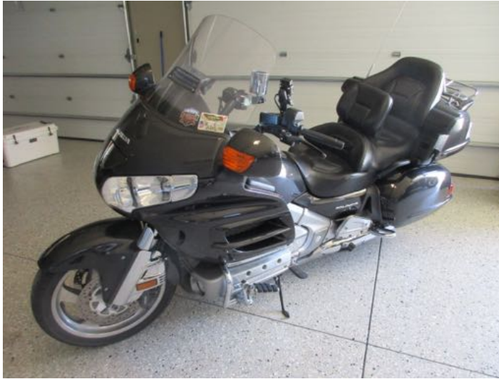
2010 Honda Goldwing GL 1800. 85,000 miles $10,500.