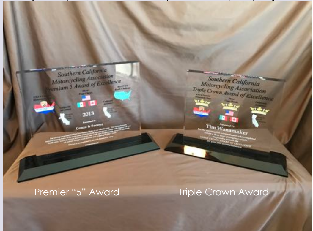
Premier “5” Award

We look forward to presenting this award to past and future finishers who complete all 5 Premier Events in a single calendar year!