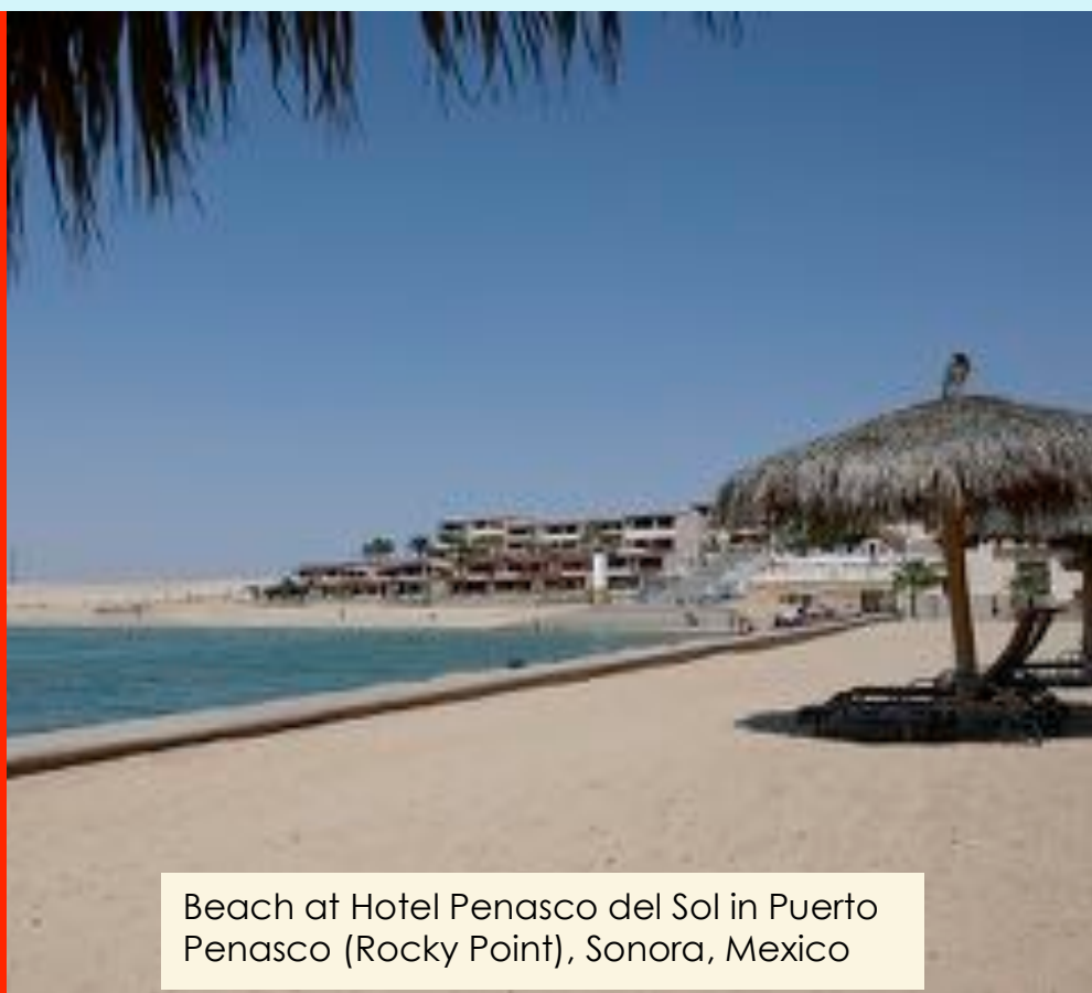
Beach at Hotel Penasco del Sol in Puerto Penasco (Rocky Point), Sonora, Mexico