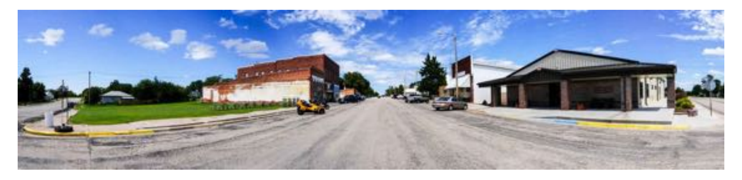
Lebanon Community Center on far right side of Main St Post Office to its left...same side of streat Ladow's Market and Restaurant on the left side of Main St