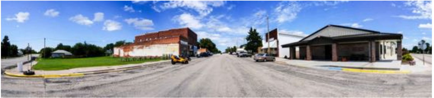
Lebanon Community Center on far right side of Main St Post Office to its left...same side of street Ladow's Market and Restaurant on the left side of Main St