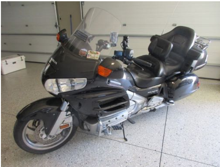
2010 Honda Goldwing GL 1800. $13,500.

If you are interested in helping us please call or email Gonzo) or any member of the SCMA board of directors