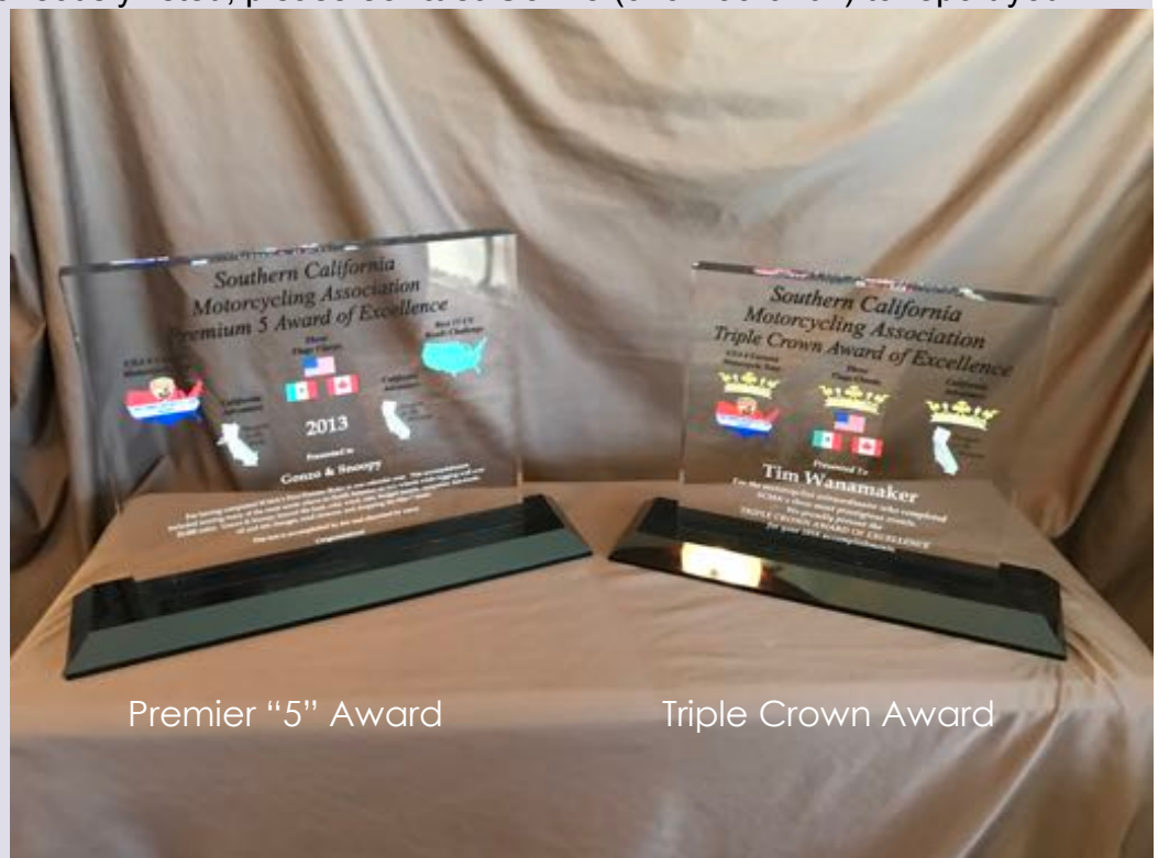
Premier “5” Award

We look forward to presenting this award to past and future finishers who complete all 5 Premier Events in a single calendar year!