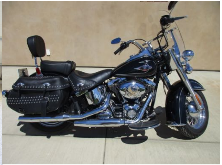
2011 Harley Heritage Softail Classic. $12,900