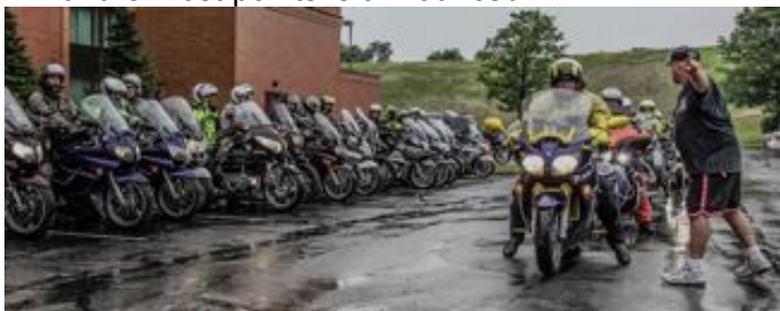
Start of 2013 Iron Butt Rally – No rain date ☺

There is another type of rally that offers some challenge and involves a lot more riding. This type of rally is a form of a scavenger hunt. The rally has a start and end time location. It may be held in one day or stretch out over 11 days. Before the start of the rally, riders are provided a list of bonus locations within a specified territory. Give the time available, riders must decide which bonus locations they will ride to, obtain proof of visit, and make it back to the finish before the designated "end" time. Their bonus location points are added up and the winner with the most points is announced.