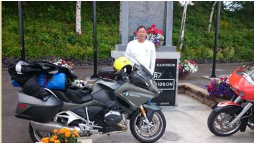
The 4th Corner and Four Corners Park - Madawaska, ME

I had to get back to work so I made arrangements with the BMW dealer in Portland to ship my bike back to WA. Total miles on the GPS were 7895 plus the round trip miles up and back from Puyallup to Blaine made the trip a little over 8000 miles in 17 days.