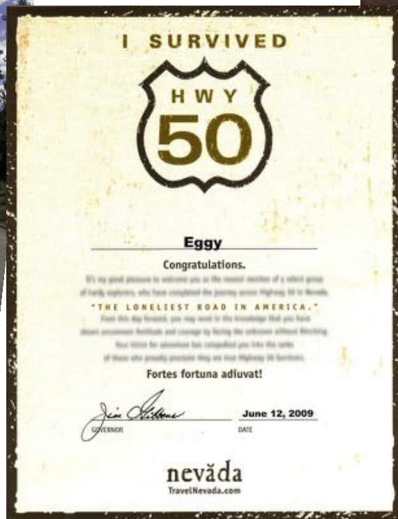
NV Governor's Certificate