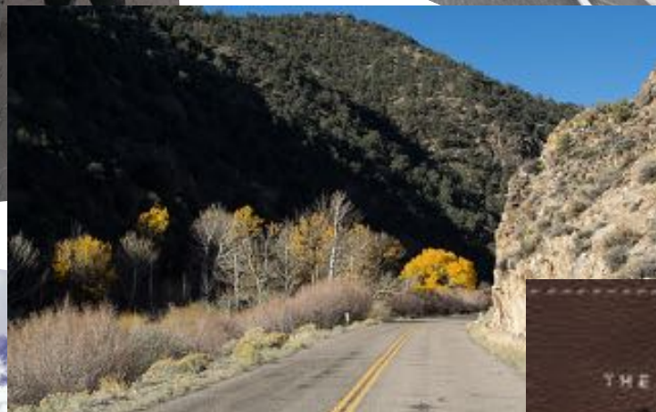
Old US-50 Canyon