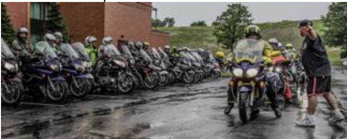
Start of 2013 Iron Butt Rally – No rain date ☺

There is another type of rally that offers some challenge and involves a lot more riding. This type of rally is a form of a scavenger hunt. The rally has a start and end time location. It may be held in one day or stretch out over 11 days. Before the start of the rally, riders are provided a list of bonus locations within a specified territory. Give the time available, riders must decide which bonus locations they will ride to, obtain proof of visit, and make it back to the finish before the designated "end" time. Their bonus location points are added up and the winner with the most points is announced.