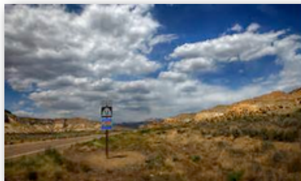
The Road to Torrey: Utah 12 Is Featured for the 2014 Three Flags Classic