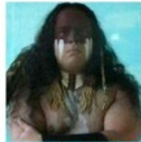
BLUE MOUNTAIN TRIBE