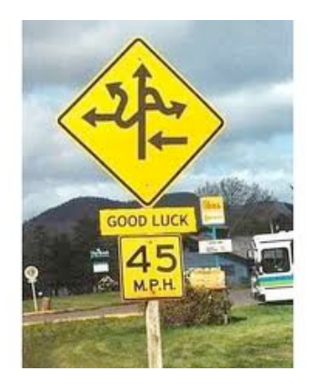
Pick Any Road--You'll Arrive Somewhere

Riders continue to sign up during these late spring and early summer months--as we have seen from year to year. We are approaching 100 entrants for 2013--assuming the incomplete applications are perfected. We will probably hit 120 this year. The most frequent problem is a missing or incompletely filled-out Release of Liability (ROL). Remember that the ROL form needs to have the event and estimated ride dates written on the top, your printed and signed name, and a signature of a witness. Until SCMA membership is verified, completed application, ride fee and the completed ROL are in the hands of Bill Allen, the USA4C ride chairman, he can not send you the starter package.