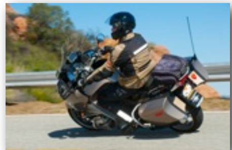
Let's Ride Deadman's Curve

Victor McLaglen Motor Corps www.thevmmc.com