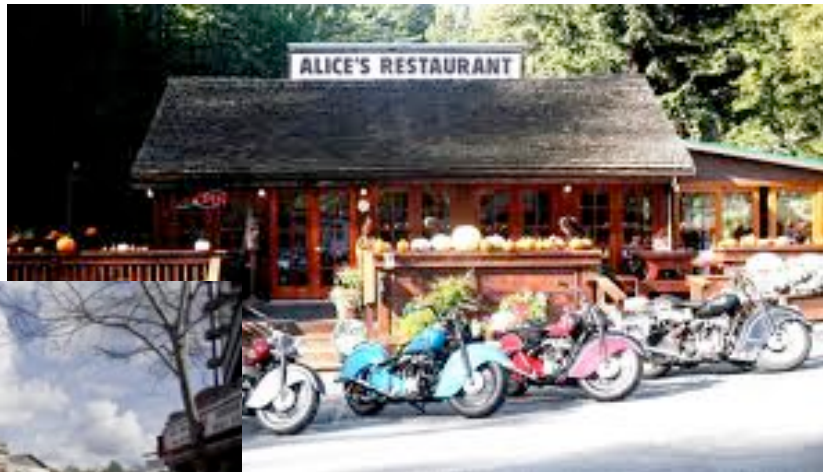
Above: You actually can't get anything you want at Alice's Restaurant. See for yourself on Sunday