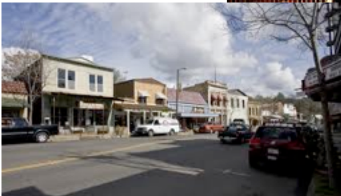
Left: Angel's Camp: A Bit of California's Gold Rush History on Saturday