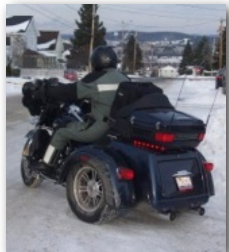
Let's Ride s

Victor McLaglen Motor Corps www.thevmmc.com