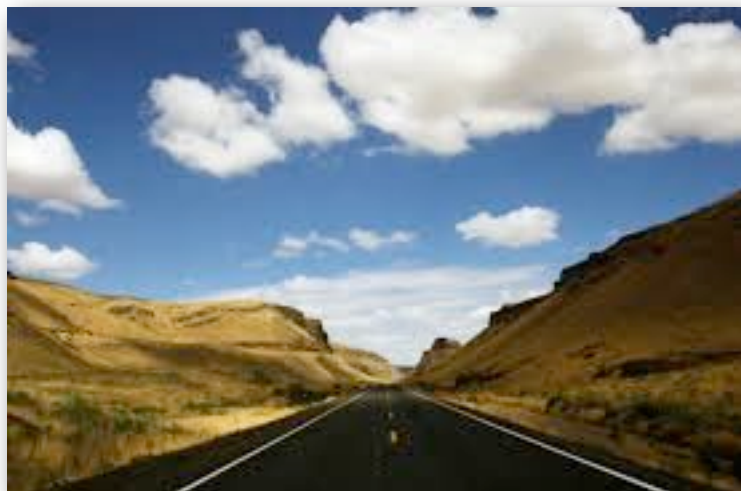
The Road Ahead SCMA and its Affiliated Clubs offer a large array of Riding Opportunities

Make Your Big Summer Riding Plans Now: Three Flags Classic, USA Four Corners, Cal Mission Tour, Cal Parks Adventure, Best 15 US Roads Challenge