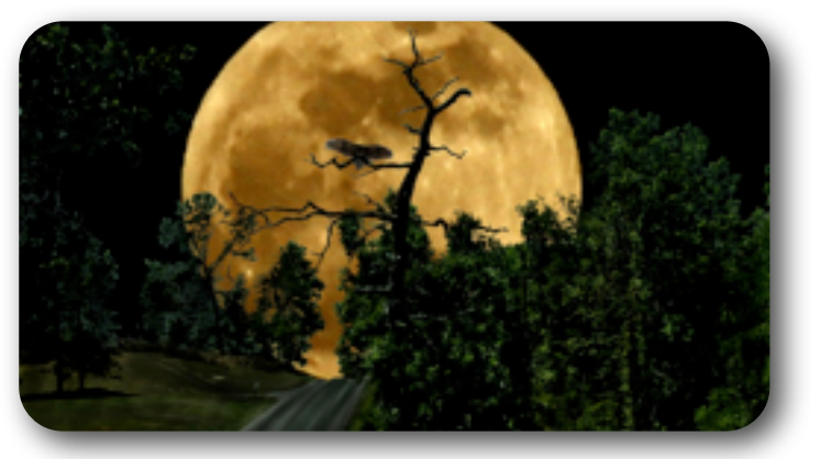
Fall Riding Is Ahead. SCMA and its Affiliated Clubs Have Roads Ready for You to Explore--at your Own Risk of Course. Watch out for the Goblins!

Who Knows What Dreadful Fate Awaits you on The Dark Forest Road Ahead?