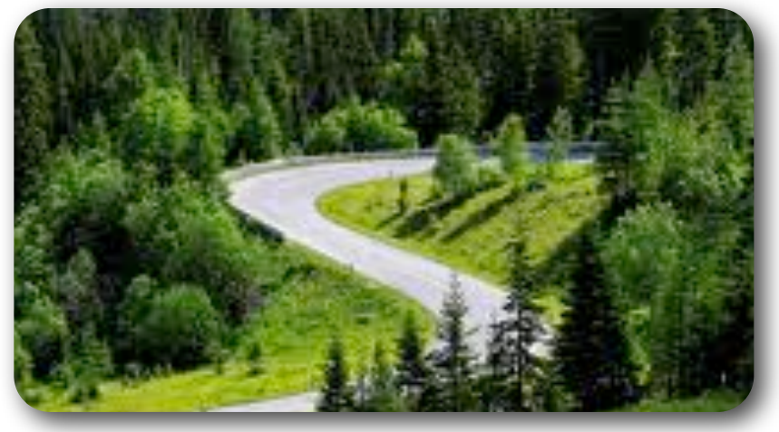
SCMA and its Affiliated Clubs Help You FInd Rides Like This. Spread the Word. Help Us Grow. Join Us for the Joy of It.

May All of Your Days Be Filled With Roads Like This