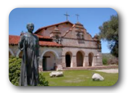
SCMA's California Parks Adventure and California Mission Tour provide you a great opportunity to see our favorite state in a different light. Check out more in the article found on page 5.

Victor McLaglen Motor Corps www.thevmmc.com