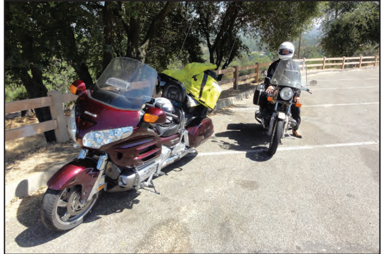
Clockwise from left: Horse in Battle Dress, the Fossil, the antique (1979 BMW R65)