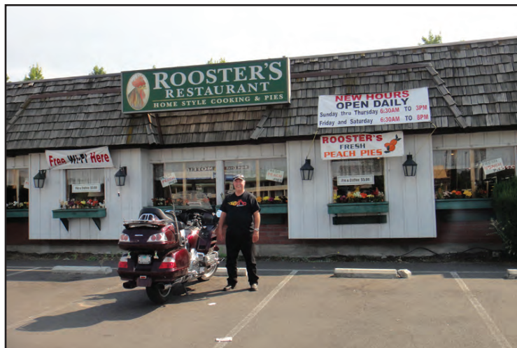
That's a Big Bike.