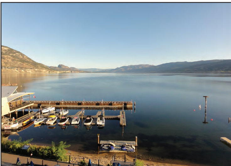
Lake Okanagan, Penticton, British Columbia as seen from the window of our hotel room.

This year, with our committee involvement, we never got out of the conference room. I had expected that we would work, of course. You don't serve on a committee and think you are not going to work. I don't regret a minute of it. We only saw Penticton as we came into and left town, and from the hotel.