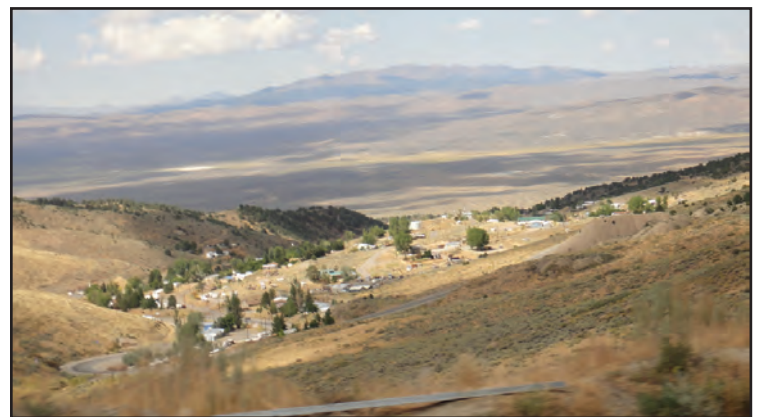
Out in the "beautiful nowhere of Hwy 50" we met people whose kids take their BMW's to Sierra BMW.

Coincidences along the way made it a funny trip.