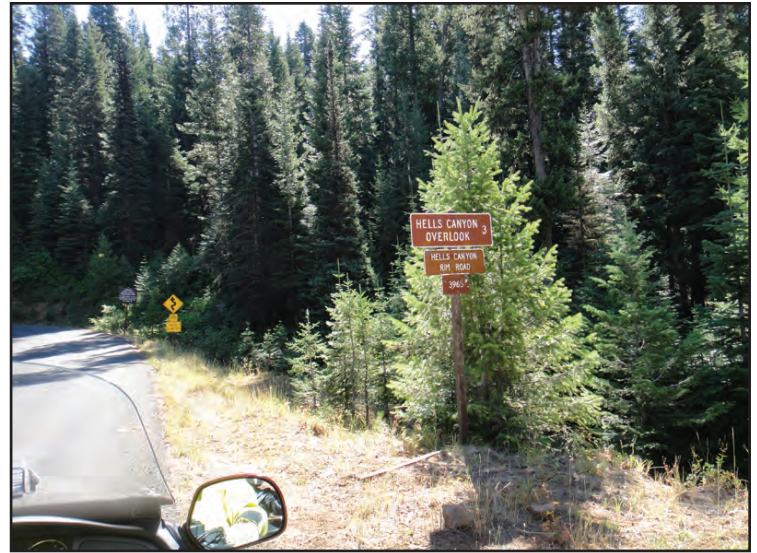
The "twisties" on Forest Road # 39 west of Enterprise, OR.

The very best thing about becoming a passenger was that I became The Photographer. Not that I am good at it, but last year Dannie got me a fool proof camera for Mother's Day that also does videos with sound. I shot stills, I shot video, and there are the usual shots of the inside of a pocket. I held the camera backward and eventually got a shot of Eleanor behind us, riding at her professional best as always. I got some great video as we paced a speed boat on the Snake River and rode the "twisties."