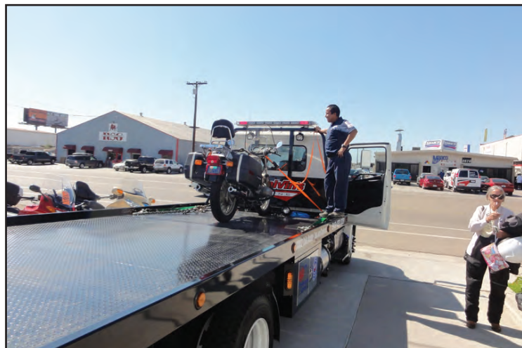
We have a friendly rivalry concerning our brand preferences.